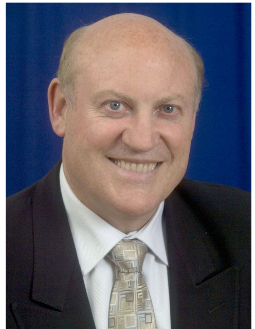
Farm Writers' patron Minister for Natural Resources, Primary Industries and Mineral Resources Ian Macdonald.

☞ To book your place for the Christmas lunch go to our website: www.nswfarmwriters.org/BOOKINGGS.htm . To get your book of 6 ($360) or 12 ($720) vouchers, contact Richard.Hincks@rabobank.com .